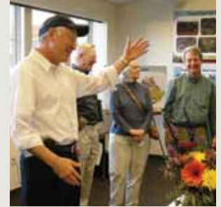
Snapshots from the CIC reception earlier this year.