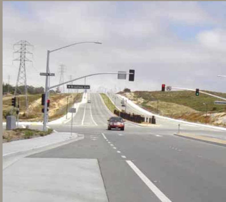
From the road work to the landscaping the transformation of General Jim Moore Blvd. and Eucalyptus Road will benefit the Monterey region.

In accordance with the Capital Improvement Program, FORA has an obligation under the California Environ-