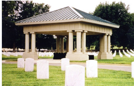
▪ committal service shelter