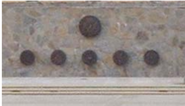
▪ service seals