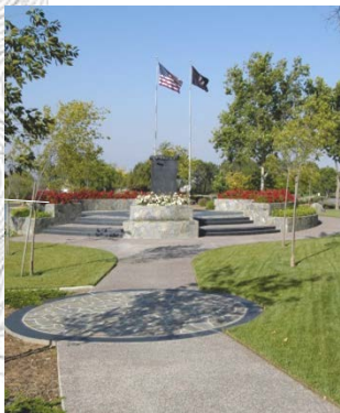
cemetery master plan