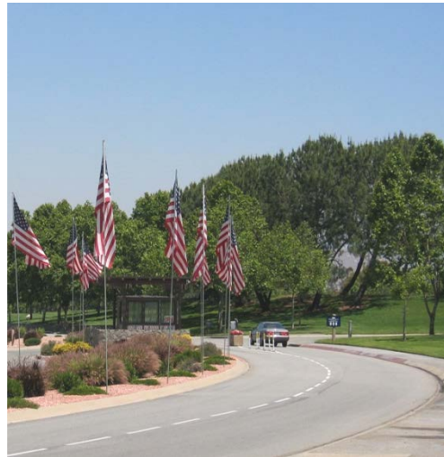
▪ flag-lined drive