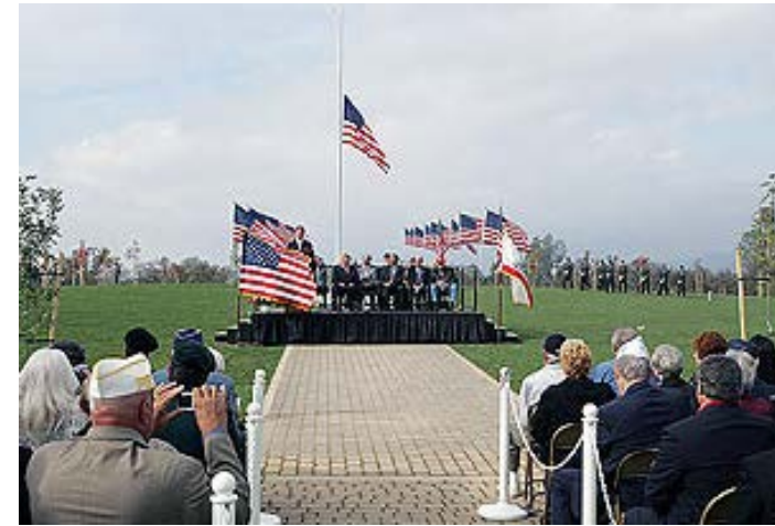
▪ memorial plaza for assemblies