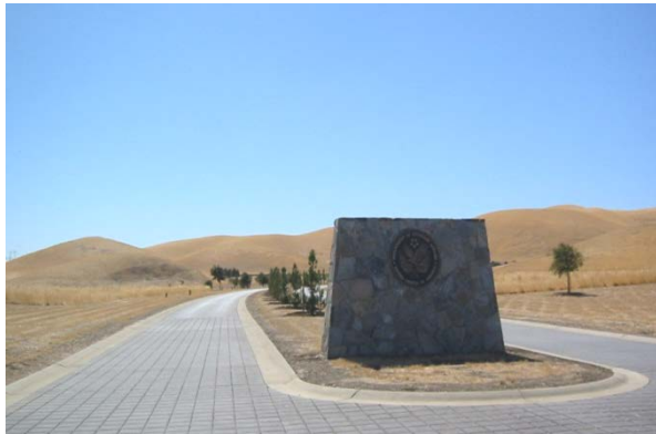
▪ formal gateway