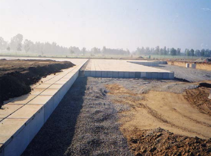
crypts (4,370) full casket (230)