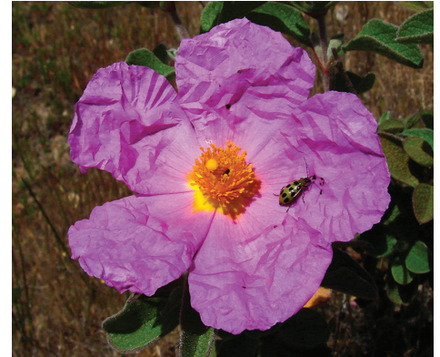
The Rock Rose.

The HCP will be coordinated by a Joint Powers Authority --- the Fort Ord Regional Habitat Cooperative (Cooperative). The Cooperative includes: FORA, County of Monterey, the Cities of Marina, Seaside, Del Rey Oaks, and Monterey, California State Parks, University of California, CSUMB,