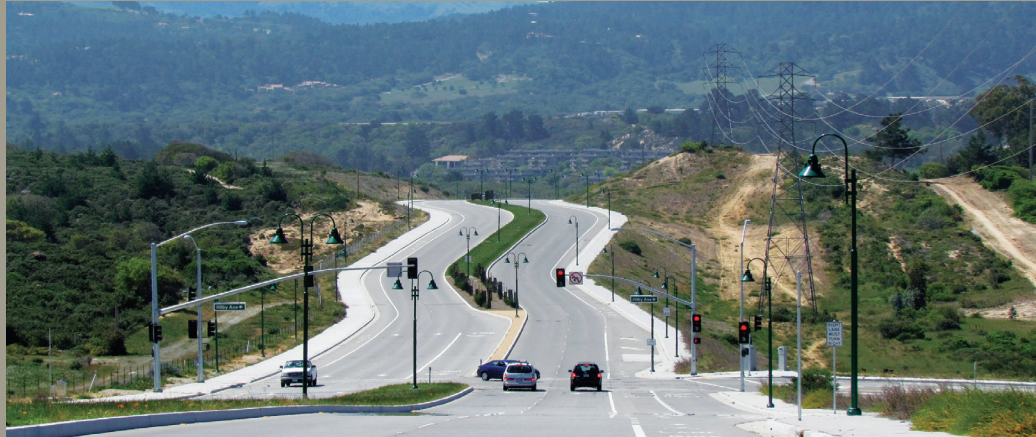
General Jim Moore Boulevard looking south from Seaside to Del Rey Oaks.

and telecommunication lines, as well as supportive infrastructure for the Aquifer Storage & Recovery Water Project for the Seaside water basin. Work progressed to construction of new lanes, bike lanes and bus stops, paving, installation of street lights and signals, landscaping and erosion control. Over $7.5 million in grant funds provided the ability to construct over $34 million in GJMB and Eucalyptus Road improvements.