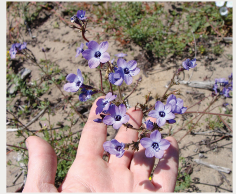
The Sand Gilia making a comeback.

USFWS and CDFW are the final arbiters as to what the final endowment amount will be, with input from FORA and its contractors/consultants. It includes line items for wild life conservation measures, weed abatement, vehicles, tools and personnel as well as monitoring and reporting. It is