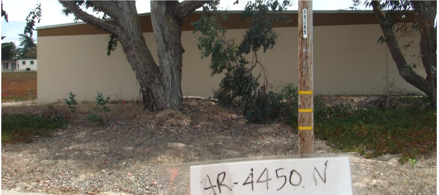
AR-4450 Existing Site: sht 2

Phone: (831) 883-3672 • Fax: (831) 883-3675 • www.fora.org