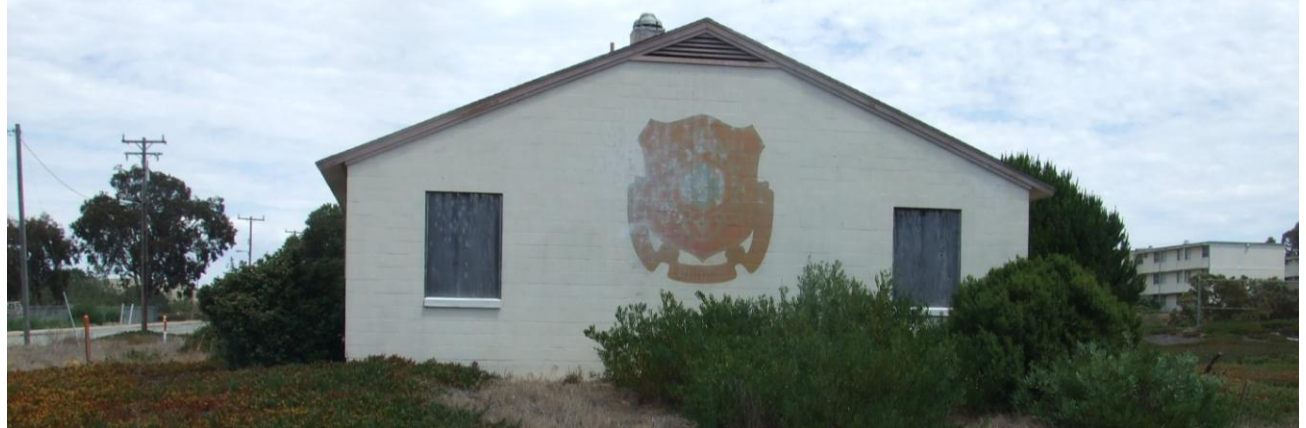
AD-4408 Existing Site: pg 2